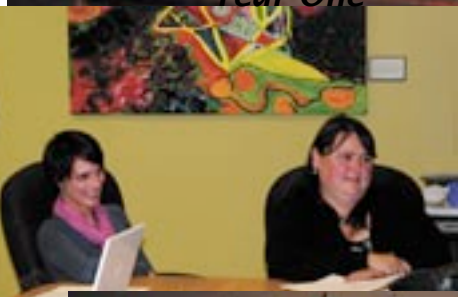
← Meetings, meetings, meetings. And always with smiles.