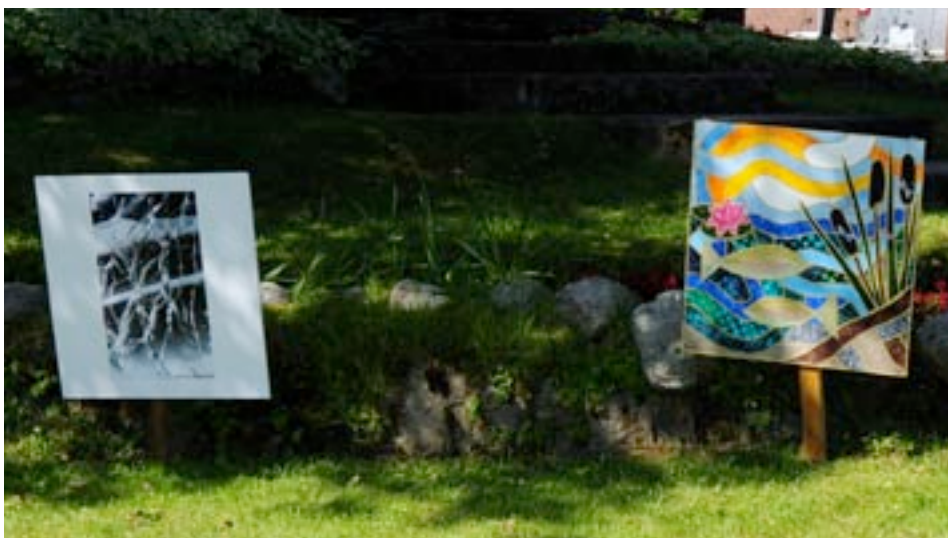
2x2 4 U, artworks produced on 2 ft square pieces of plywood, brought art into the elements this year. About 20 artists produced pieces for the project.

Of Love and War: Kenora's War Brides Oct 13-Nov 14, LOW Museum. This exhibit commemorates our war brides through the combined efforts of the war bride, the museum staff and a local artist.