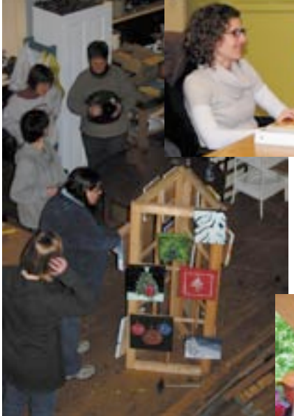
↑ Volunteers gathered to put final touches to LOWAC's Christmas Tree. It raised $550 for LOW Community Foundation